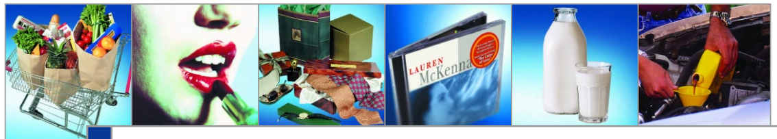
Auto Splice Dual Unwinder With Festoon