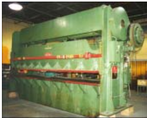
150 Ton DREIS & KRUMP #518-DSS, 6" Str., 16-3/4" Die Space, 26" x 17" Windows, 15 HP Stock # 31724 ..... $45,000

18" Str., 38" S.H., 48" x 84" Bed, 16 SPM, 25 HP Stock # 31199 Price: $40,000