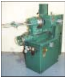
3" OLIVER #600 28" Drill Lgth Cap., 80 to 160° Grinding Angles, 1-1/2 HP Stock # 30558 Price: $6,950