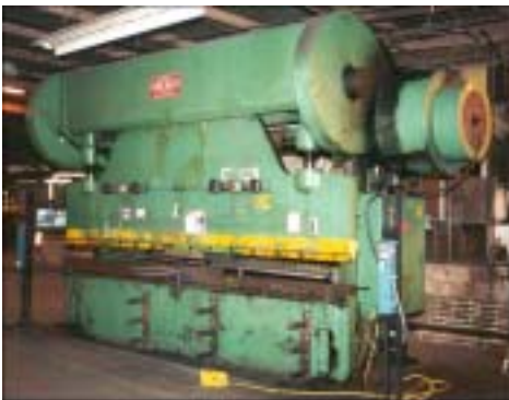
325 Ton DREIS & KRUMP #325D12 , 12'6" Bet. Hsgs., 14'6" OA Bed, 4" Str., 3 & 25 SPM Stock # 31177 ..... $39,500