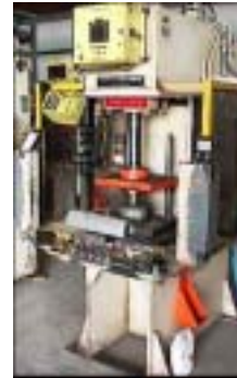
30 Ton HACKETT PRECISION

72" Str., 24" S.H., 96" Dylt., 60" x 60" Bed, 30 HP Stock # 30019 Price: $65,000