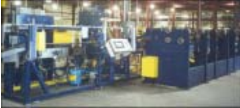
4" VULCAN-BREHM , 1" to 36" Cut Lgths., 1994 (Rebuilt Head & New Computer in 2000) Stock # 31765 ..... $125,000