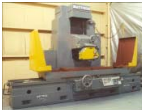
24" x 72" MATTISON #2 , 79-1/2" x 24" Work Table, 30 HP Stock # 31781 ..... $59,500