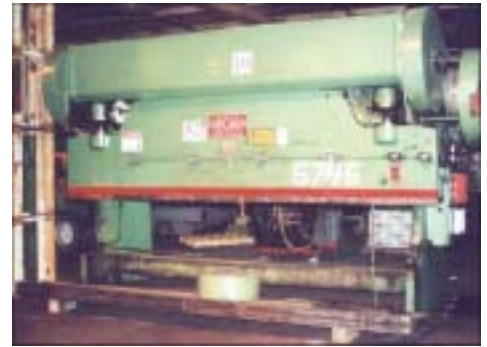
225 Ton DREIS & KRUMP #225-D-12 , 12'6" Bet. Hsgs., 14'6" OA Bed, 3" Str., 30 SPM, 15 HP Stock # 31190 ..... $19,500