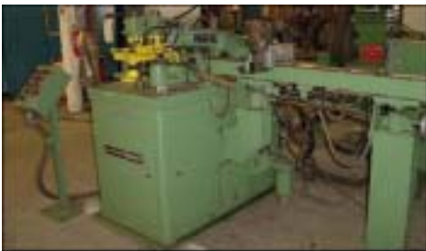
1-1/2" PINES #15 , Dynacut, 2-1/2" to 60" Cut Lgth., 6200 PPH, 5 HP Stock # 31472 ..... $29,500