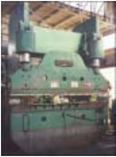
600 Ton CINCINNATI #600H

Hyd., 8'6-3/4" Bet. Hsgs., 12' OA Die Surf., 3/4" Bending Cap., 12" Str., 50 HP Stock # 32029 Price: $47,500