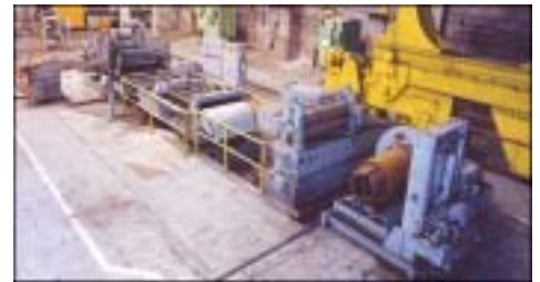
48" x 14 Ga. x 25,000 Lb. HERR EQUIPMENT Stock # 30292 ..... $59,500