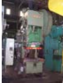
Press, O.B.I.: 150 Ton VERSON #150

10" Str., 22" S.H., 30" x 50" Bed, 35 SPM Stock # 32322 Price: $27,500