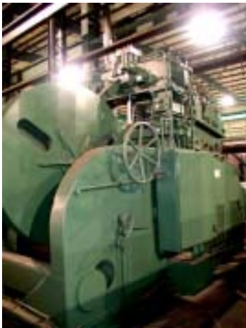
20,000 Lb. SESCO Coil Cradle & Straightener Stock # 32345 ..... $6,950