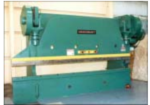
300 Ton CINCINNATI #12 , 12'6" Bet. Hsgs., 16' OA Bed/Ram, 4" Str., 4.3/30 SPM, 20 HP Stock # 30385 ..... $59,500