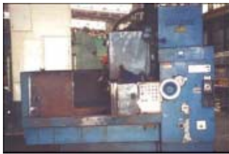
36" MATTISON #24 , 22" Dia. Segmented Wheel, 24" Under Wheel, Dresser, Nutrol & Rectifier, 100 HP Stock # 31531 & 2 ..... $19,500 Ea.