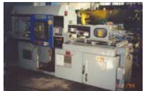
#H3 60AMT NEWBURY , Horiz. Clamp, 2.7 Oz. Shot Cap./Polystyrene, 44 Lbs. Per Hour Plasticizing, 4" Injection Str., 60 Ton Mold Clamping, 12" Mold Clamping Str., 100 Lbs. Hopper, 15 HP, 1995 Stock # 30121 ..... $19,500