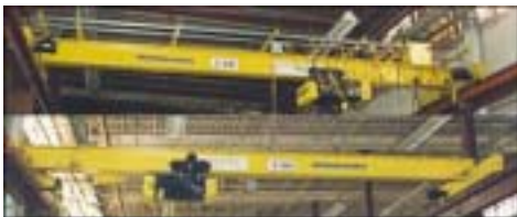
5 Ton DELTA CRANE SYSTEMS, 25' Span, 26' Lift, 1996 Stock # 31361 ..... $25,000