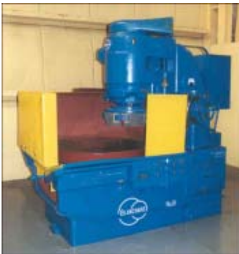
42" BLANCHARD #18 , 48" Max. Swing Inside Guards, 12" Max. Under Wheel, 22" Dia. Segmented Wheel, Power Spindle Elev., Wheel Dresser, 40 HP Stock # 30685 ..... $29,500