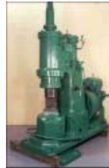
500 Lb. NAZEL #4B

Open Die, 50" x 21" Anvil, 22" x 10" Ram Stock # 31889 Price: $2,500