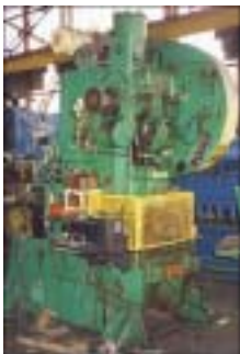
90 Ton NIAGARA

S.B.G., 6" Str., 19" S.H., 39" x 30" Bed, 40 SPM Stock # 30513 Price: $19,500