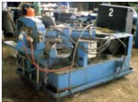
2-3/4" EAGLE #85-349 , Tube Miter Cut-Off, Dbl. Blade, 15 HP Stock # 30753 ..... $14,500