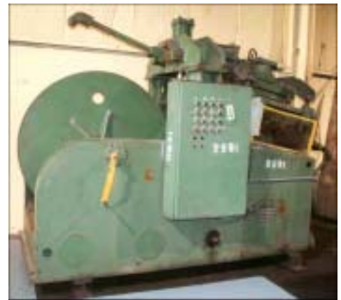
32" x .250" x 20,000 Lb. COILMATIC , 2 Over 3, Entry & Exit Pinch Rolls Stock # 30728 ..... $24,500