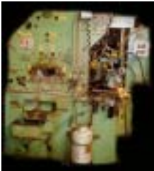
3/8" HAVEN #802