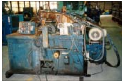
3" PINES #30 , Dynacut, 3" to 60" Cut Lgth., 20' Tube Table, 10 HP Stock # 30672 ..... $54,500