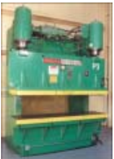
200 Ton NIAGARA #HD200-6-8

73" Bet. Hsgs., 24" FB x 96" LR Bed & Ram, 18" Str. Stock # 32162 Price: $39,500