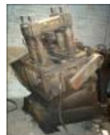
75 Ton ALPHA #75-14-5