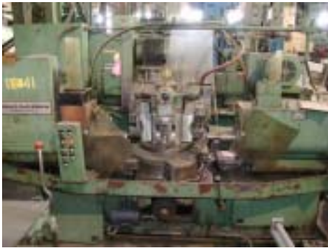
Automatic Chucking Machine: GOSS & DELEEUW #1-2-3, 3-1/2" Spdl. Dia., 3 HP Stock # 32328 & 9 ..... $1,500 Ea.