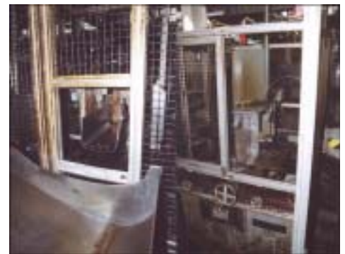
12-1/2 Ton HILL ENGINEERING, Hyd., 4" Str., 8-1/2 SPM, 10 HP Stock # 32213 ..... $24,500