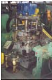
2" YODER #P-40