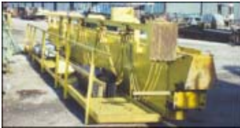
10 Ton SHAW BOX, 44'-8-3/4" Span, 30' Lift, 20 HP Stock # 30635 ..... $22,500