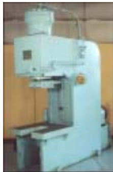
75 Ton FARQUHAR #35434

12" STR., 22" Open Ht., 10" Closed Ht., 20 HP Stock # 30710 Price: $17,500