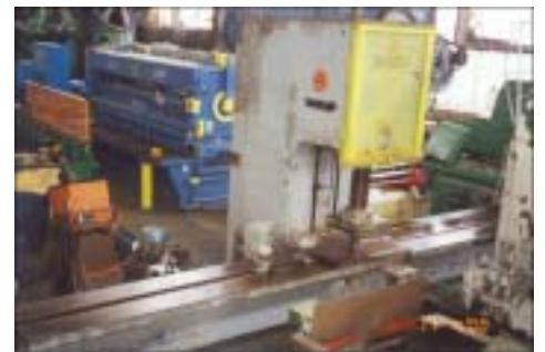
150 Ton RODGERS #GP150-1, Hyd., 30" Dylt., 15 HP Stock # 30155 ..... $24,500

108" Str., 120" Dylt., 120" x 264" Work Area, 75 HP Stock # 30153 Price: $350,000