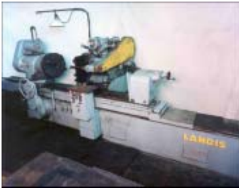
24" x 96" LANDIS #3RH , 25-1/2" Swing Over Table, 18" 4-Jaw Chuck, 10 HP Stock # 31961 ..... $29,500