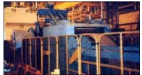
48" x .189" x 50,000 Lb. AUTOMATIC FEED CO. , 1988 Stock # 30157 ..... $75,000