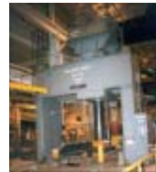
1000 Ton WILLIAMS & WHITE

108" Str., 120" Dylt., 120" x 264" Work Area, 75 HP Stock # 30153 Price: $350,000