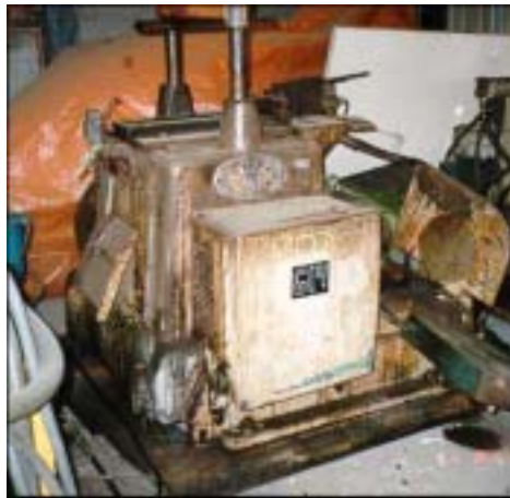
50 Ton TISHKEN #CO-12-12-50, 2" Str., 8" Max. Cut Width, 9-1/2" FB x 17-1/2" LR Bet. Posts, 15 HP Stock # 31632 ..... $12,500