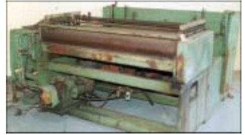
60" x 14 Ga. ENGEL , 3 Over 4 Str., 10 HP Stock # 31676 ..... $19,500