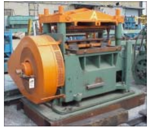
50 Ton YODER #P-50-S, 5" Str., 50 SPM, 7-1/2 HP Stock # 32132 ..... $24,500