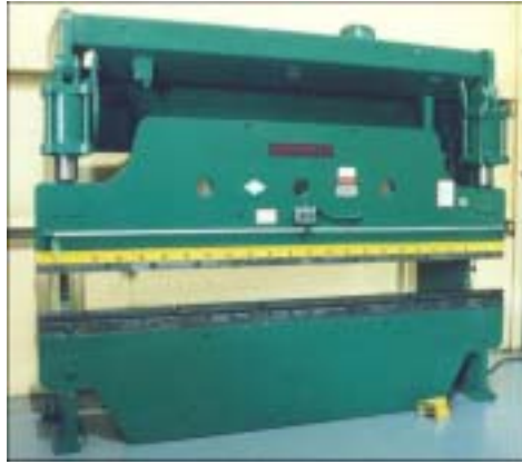
135 Ton CINCINNATI #135CDX10 , Hyd., 10'6" Bet. Hsgs., 12' OA Bed, 8" Str., 15 HP Stock # 31192 ..... $34,500

73" Bet. Hsgs., 24" FB x 96" LR Bed & Ram, 18" Str. Stock # 32162 Price: $39,500