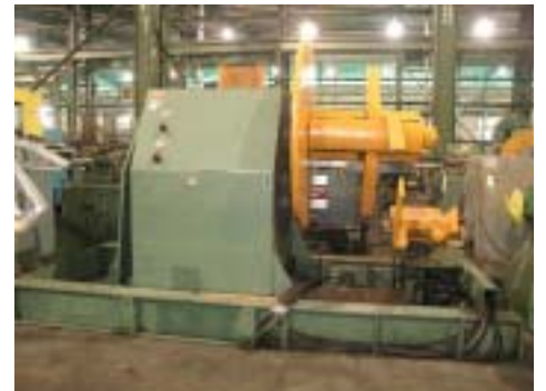
Uncoiler, Coil Lift & Straightener: 10,000 Lb. AMERICAN STEEL LINE #3-11 Stock # 32337 ..... $19,500