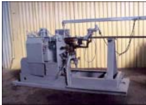
2" MODERN #2K , 20' Rack Feed, 7-1/2 HP Stock # 30753 ..... $14,500