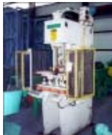
10 Ton P.H. #OGF.10

24" Str., 28" Open Ht., 4" Closed Ht., 30-1/4" x 30-1/4" Bed, 10 HP Stock # 30853 Price: $19,500