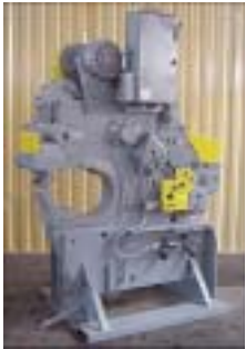
4"x 4" x 1/2" BUFFALO #1/2

75 Ton Punching, 1-3/4" Sq., 1-7/8" Rd., 10 HP Stock # 31873 Price: $9,950