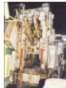
120/80 Ton BLISS #3-1/2B

10"/16.5" Str., 24"/22" S.H., 26-1/2" x 25" Bed, 15 SPM Stock # 32143 Price: $25,000