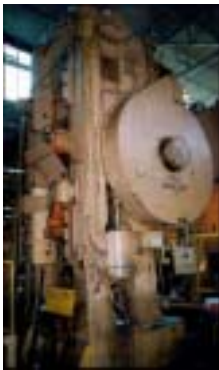
1000 Ton CLEVELAND #10K

16" Str., 36" S.H., 42" x 45" Bed, 40 HP Stock # 30175 Price: $85,000