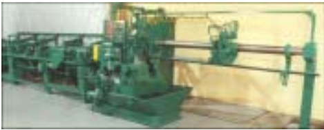
4" BARDONS & OLIVER #34 , 20' Magazine Feed, 10/13 HP Stock # 31802 ..... $34,500