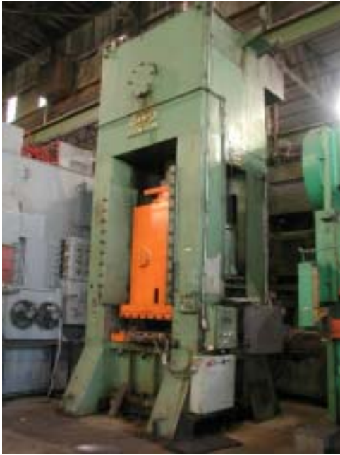
500 Ton DANLY SSSC Press Stock # 32323 ..... $49,500