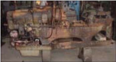
2" BARDONS & OLIVER #2B , (2) Flaring on Deburring Attach., 3 HP Stock # 30893 ..... $5,000