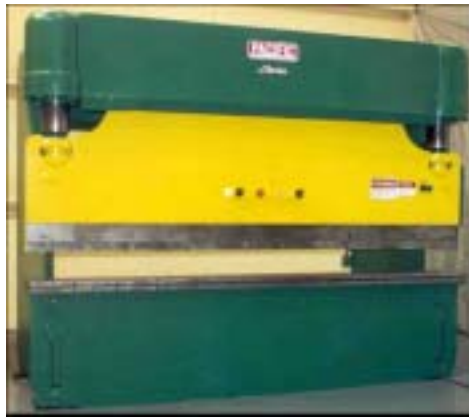
225 Ton CINCINNATI #9 , 8'6" Bet. Hsgs., 10' OA Bed/Ram, 3" Str., 33 & 7 SPM, 15 HP Stock #'s 31180 & 1 ..... $29,500 Ea.