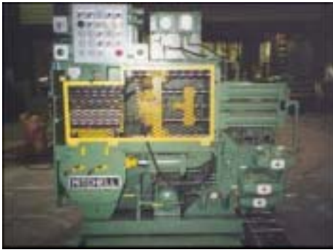
33,000 Lb. MITCHELL , 2-Die, Hyd., Rod Push Pointer, 20 HP Stock # 32068 ..... $79,500