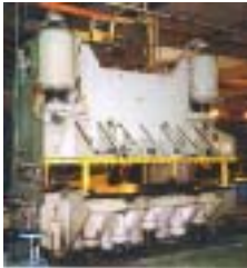
Brake, Press: 600 Ton PACIFIC

Hyd., 3/4" x 10" Bending, 10' Bet. Hsgs., 14' OA Bed & Ram, (2) 35 HP Stock # 32317 Price: $49,500