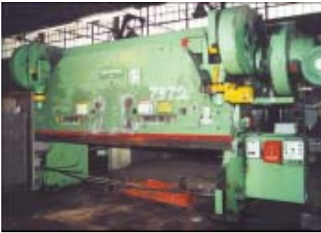
300 Ton CINCINNATI #12 , 12'6" Bet. Hsgs., 14' OA Bed, 4" Str., 30 & 4.3 SPM, 30 HP Stock # 31194 ..... $39,500

Hyd., 8'6-3/4" Bet. Hsgs., 12' OA Die Surf., 3/4" Bending Cap., 12" Str., 50 HP Stock # 32029 Price: $47,500