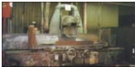
24" x 72" MATTISON , 80" x 24" Tbl., 30 HP Stock # 30465 ..... $19,500