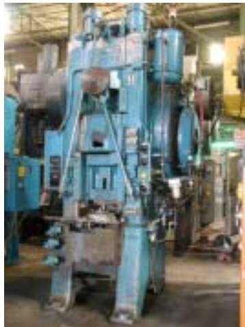
250 Ton MINSTER Knuckle Joint Press Stock # 32313 ..... $24,500