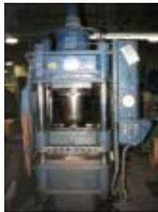
150 Ton WILLIAMS & WHITE

21" Str., 30" Dylt., 10 HP Stock # 30403 Price: $15,500