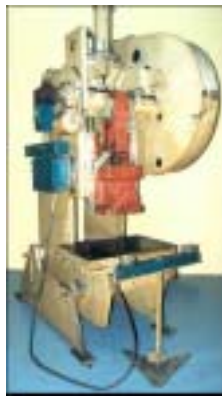
75 Ton NIAGARA #M-75

1-1/2" Str., 15-1/2" S.H., 25" x 39" Bed, 90 to 280 SPM, 10 HP Stock # 30079 Price: $24,500