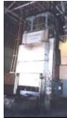
1000 Ton CLEARING #HC1000-60x60

16" Str., 24" Dylt., 20-1/2" x 24" Bed, 5 HP Stock # 29987 & 90 Price: $14,000 Ea.