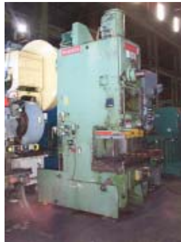
90 Ton NIAGARA O.B.I. Press Stock # 32311 ..... $12,500