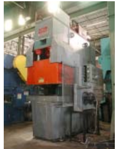
120/75 Ton BRANCH Triple Action Draw Press Stock # 32324 ..... $15,500