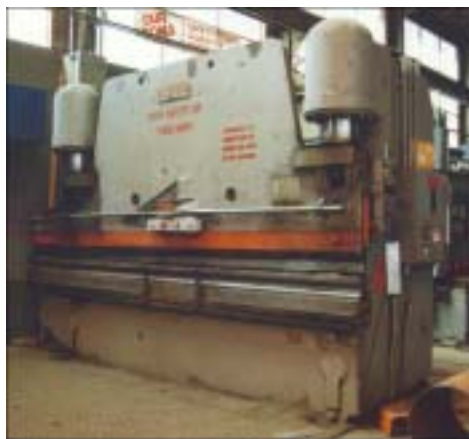
400 Ton PACIFIC #K400-14/10 , Hyd., 10'4-1/2" Bet. Hsgs., 14' OA Bed/Ram, 12" Str., 40 HP Stock # 29978 ..... $39,500