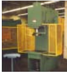
50 Ton GREENERD #H-50-21RS-30-21

21" Str., 30" Dylt., 10 HP Stock # 30403 Price: $15,500