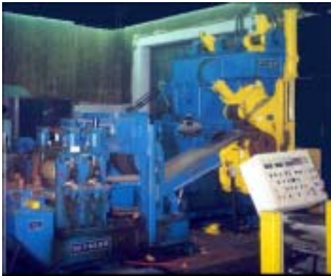
OCTAGON, Recoiler, 8" Belt Wrapper, 10 HP Stock #'s 31697 & 8 ..... $25,000 Ea.