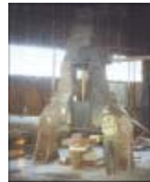
1,000 Lb. CHAMBERSBURG

Open Die, 50" x 21" Anvil, 22" x 10" Ram Stock # 31889 Price: $2,500