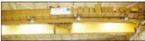
80/40 Ton P & H, 97' Span, 51' Lift, 75 HP Hoist # 1, 100 HP Hoist # 2 Stock # 30697 ..... $17,500