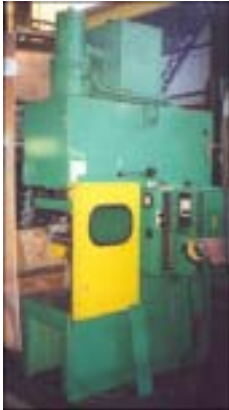
100 Ton JEB WEMA ZEULENRODA #PYE-100S1

2.36" Str., 13.43" S.H., 15.91" x 25.20" Bed, 60 SPM, 10 HP Stock # 32185 Price: $24,500