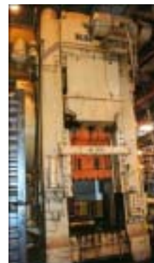
2000 Ton BLISS #30A-KJ-2000

15" Str., 42" S.H., 50" x 50" Bed, 25 SPM Stock # 30176 Price: $295,000