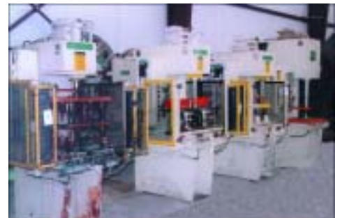
5 Ton P.H. #OFG.5, 16" Str., 24" Dylt., 20-1/2" x 24" Bed, 5 HP Stock # 29985 ..... $9,000

18" Str., 24" Dylt., 21" x 24" Bed, 15 HP, 1991 Stock # 29986 Price: $19,000