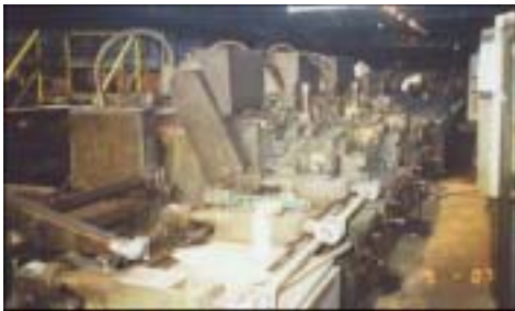
5" SUNDSTRAND #811 , 3-Head Centerless Belt, 8" x 132" Belt, 50 HP Each Head Stock # 31865 ..... $65,000