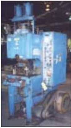
112 Ton KOMATSU/ MAYPRESS #MKN-100

2.36" Str., 13.43" S.H., 15.91" x 25.20" Bed, 60 SPM, 10 HP Stock # 32185 Price: $24,500