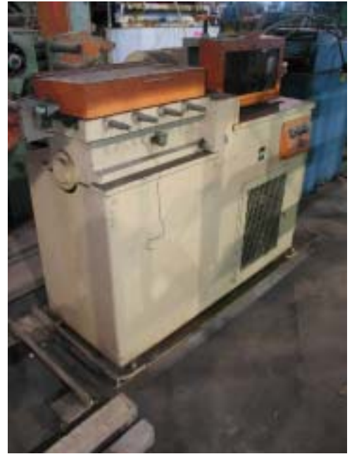
3/8" SHUSTER Straightener Stock # 32335 ..... $14,500