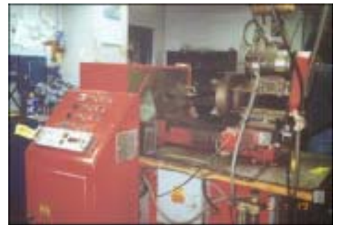
#D080M DIE QUIP CORP./PRECISE , Quill Draw, 1/4" & 3/8" Grinding Pins, 2 HP, 1991 Stock # 31871 ..... $19,500