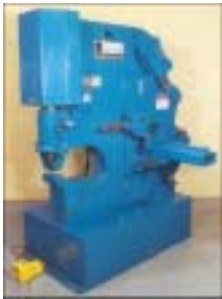
5" x 5" x 1/2" HILL ACME #5

75 Ton Punching, 1-3/4" Sq., 1-7/8" Rd., 10 HP Stock # 31873 Price: $9,950