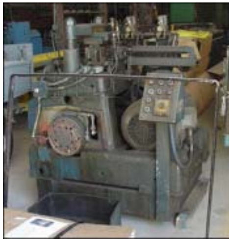
25 Ton TISHKEN #CO-10-HA, 2" Str., 7" Max. Cut Width, 6" to 7" S.H., 16" Bet. Posts, 10 HP Stock # 31632 ..... $12,500