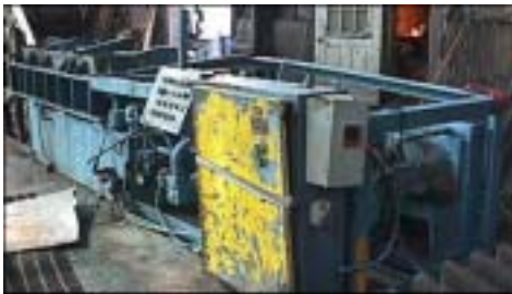
HARRIS #NF-2-12X10 , 96" L x 30" W x 12" or 20" D Press Box, 12" x 10" x Vari Bale, 30 HP Stock # 30671 ..... $27,500