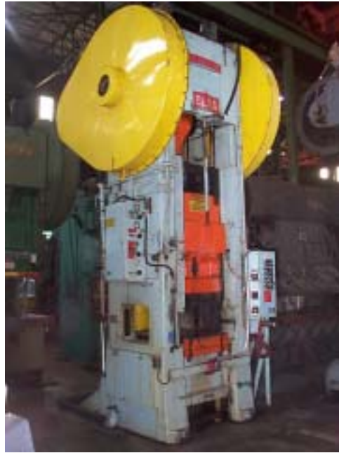
150 Ton BLISS SSSC Press Stock # 32310 ..... $24,500