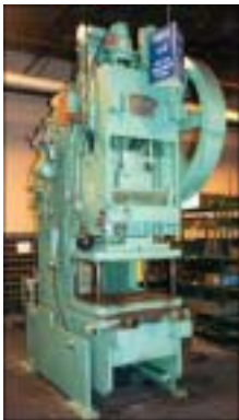
110 Ton CLEVELAND #11-I-110

S.B.G., 6" Str., 19" S.H., 39" x 30" Bed, 40 SPM Stock # 30513 Price: $19,500