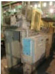
Edging Line: CAUFFIEL

Hyd., 3/4" x 10" Bending, 10' Bet. Hsgs., 14' OA Bed & Ram, (2) 35 HP Stock # 32317 Price: $49,500