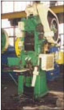
250 Ton TOLEDO #662

16" Str., 36" S.H., 42" x 45" Bed, 40 HP Stock # 30175 Price: $85,000