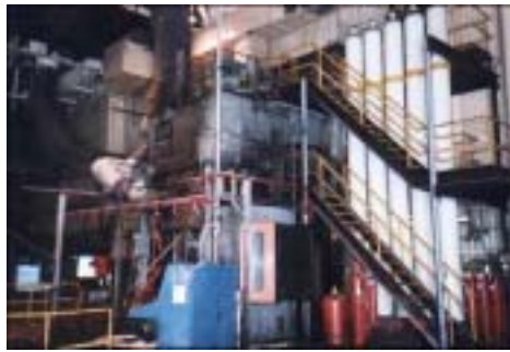
2500 Ton BLISS, 48" Str., 48" S.H., 96" Dylt., 54" x 43" Bed, 900 HP Stock # 30026 ..... $450,000