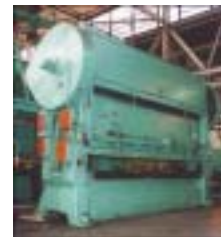
126 Ton MINSTER #50-6-162

8" Str., 162" x 34-1/2" Bed, 14-1/4" x 17-3/4" Windows Stock # 30479 Price: $25,000