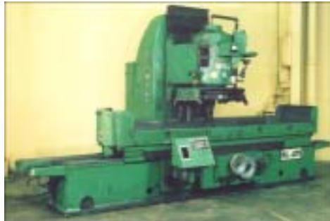
24" x 72" HILL ACME , 24" Bet. Chuck & Table Top, 75 HP Stock # 31341 ..... $59,500